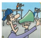
a film director